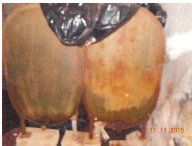
Front side of ASTs. No structural damage.