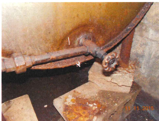
Front side of right AST and spigot. No structural damage. Rust water staining on cinder block.