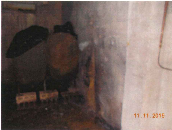
Two existing ASTs in corner of basement room.