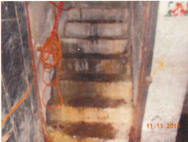
Leaking water coming down stairwell in basement. Salt and grime buildup.