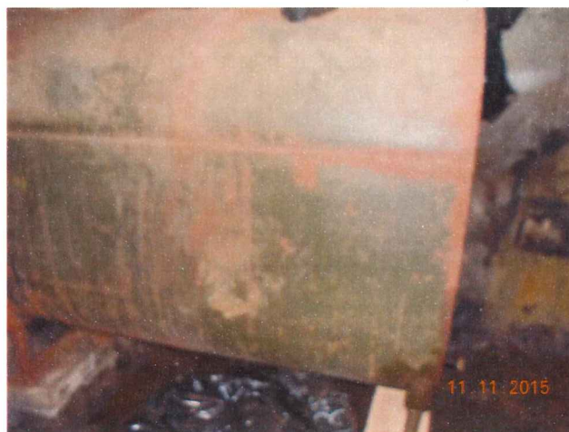
"Left side" AST sidewall condition.