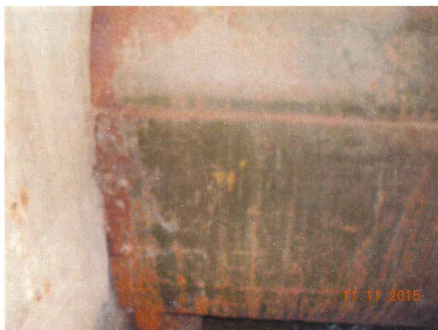
"Left side" AST sidewall condition. No structural damage.