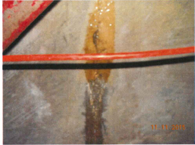
Fracture in right wall of basement stairwell. Apparent leak and infiltration of sump pump water through wall crack. Leaking water re-enters basement down basement stairs.