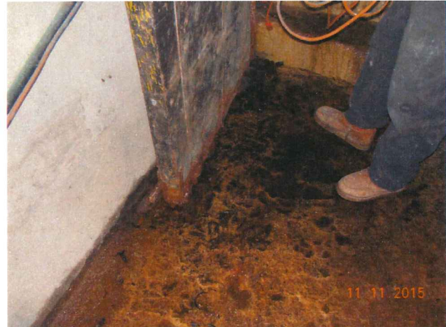
Water collection point at base of stairs. Drains toward sump pit.