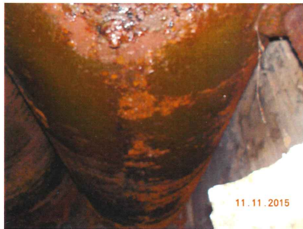
Underside of right AST (located on right side in photograph above to the left).