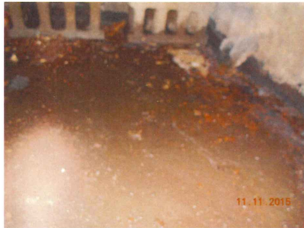
Floor area beneath ASTs. No evidence of oil sheen or staining. Heavy rust accumulation.