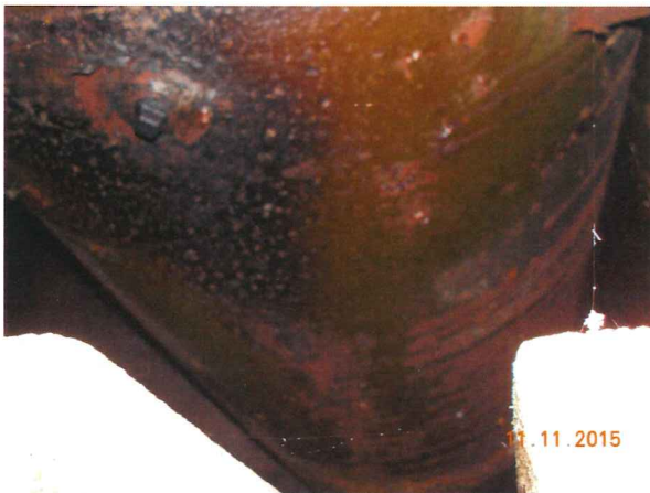
Underside of left AST (located on left side in photograph directly above).